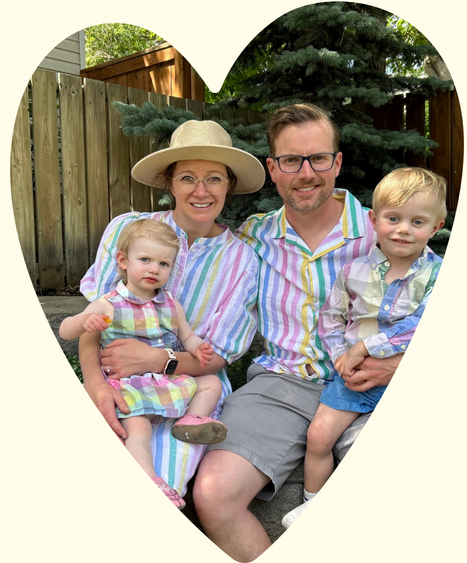
The Jensen Family - 300 Nights